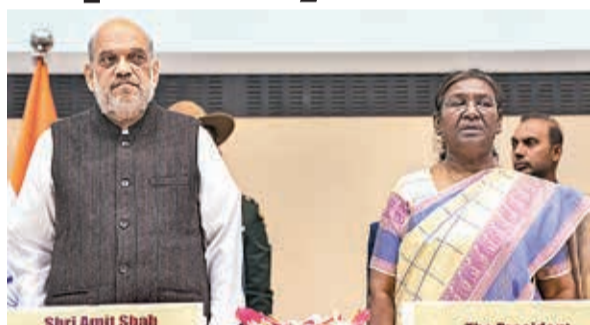
President Droupadi Murmu and Union Home Minister Amit Shah during the valedictory function of Commonwealth Attorneys and Solicitors General Conference 2024, in New Delhi, on Sunday.

Union Home Minister Amit Shah on Sunday said that the use of technology in the judicial system will bring simplicity to the whole system. He also exhorted to make the entire justice system on 3 A's which he explained as-- Accessible, Affordable and Accountable. "In today's time, it is very important to make the entire justice system on three A's i.e. accessible, affordable and accountable and for all these three we should make maximum use of technology. I believe this will bring a lot of simplicity," Shah said.