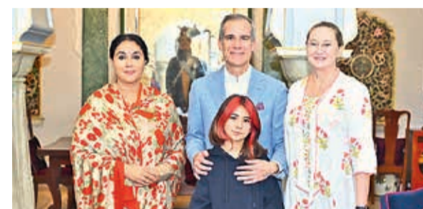
Deputy CM Diya Kumari with Eric Garcetti, the USA ambassador to India, and his family at City Palace in Jaipur on Sunday.

Meanwhile, Dy CM Diya Kumari virtually inaugurated the Craft Village located at Kunda, Amber on Sunday. The programme was concluded