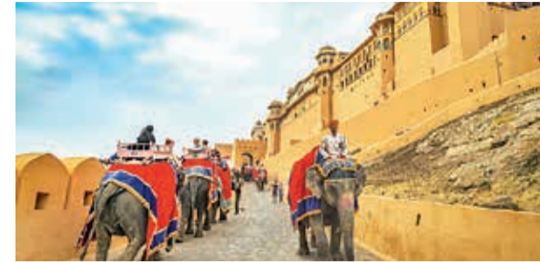
Tourists footfall shot up to over 17.90 crore in 2023.

A total of 32.44 crore domestic tourists visited Rajasthan from January 2020 to December 2023. On the other hand, over