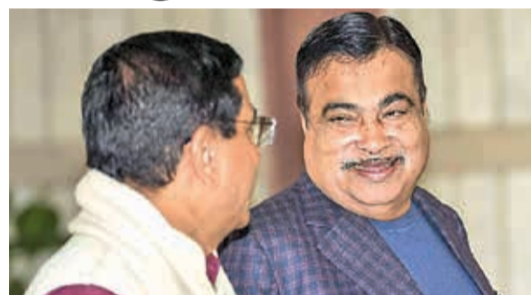
Union Minister Nitin Gadkari crossing on the Pilibhit-Basti national highway at a cost of Rs 297 crore.

Union Minister Nitin Gadkari on Sunday inaugurated three road overbridges in Lakhimpur Kheri through video-conferencing and said this will ease traffic congestion and add to the convenience of people. These overbridges have been built at Chhouch crossing, LRP crossing and Rajapur