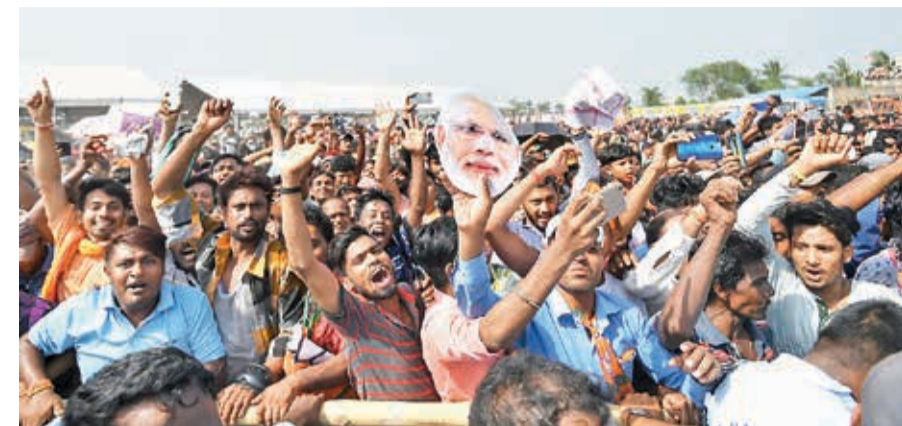
The campaign will start on February 10.