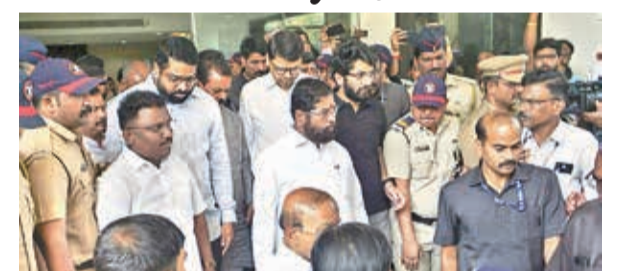
Maharashtra CM Eknath Shinde visits a hospital where injured Shiv Sena leader is being treated after he was allegedly shot in Thane.

Shiv Sena (UBT) chief Uddhav Thackeray on Sunday claimed a "gang war" has broken out in the Maharashtra alliance government and said PM Narendra Modi should understand that the state BJP unit has "weakened" due to the induction of leaders into it by breaking other parties. The former state CM's remarks came 2 days after an incident of firing by an MLA of the ruling BJP on a local Shiv Sena leader (belonging to CM Eknath Shinde camp).