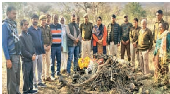
Forest officials along with locals during the cremation of female leopard in Sawai Madhopur on Sunday.

The process on the instructions has been started and soon the construction work will begin after selecting the location of the memorial. The genealogy of both the tigresses will be inscribed on the memorial. The pictures of both tigresses will be installed at the memorial.