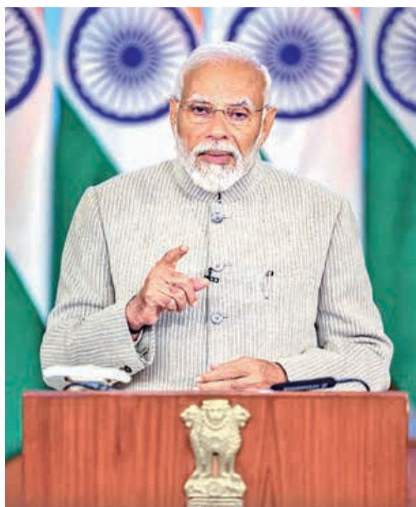
Prime Minister Narendra Modi delivers a video message at birth centenary celebrations of SN Goenka on Sunday.

He said India needs to share evidence of Vipassana science with the world according to the standards of modern science. "Stress and distress are common in the present-day life of young people and senior citizens, and Vipassana teachings can help them find solutions to their