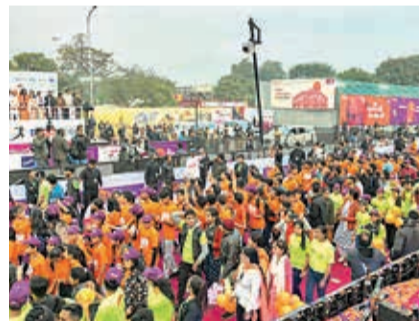
Enthusiastic participants during the 15th Jaipur Marathon on Sunday.

morning is having adverse effects on health," he said.