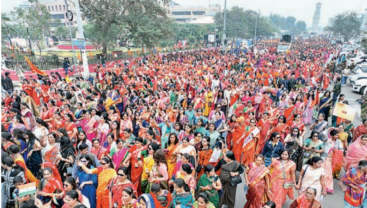
Women draped in sarees of various styles participating in the 'One Bharat Saree Walkathon' in Kota on Sunday.

Union Minister Darshana Jardosh said that "The event holds particular significance in Kota, where spirit of womanhood is deeply embedded in every aspect of its existence. The participation of women from various backgrounds, draped in sarees representing their distinct regional styles, has created a beautiful tapestry of diversity and strengthened the spirit of 'Ek Bharat Shreshtha Bharat'. This resonates with the vibrant essence of Kota and adds a layer of deep cultural significance.