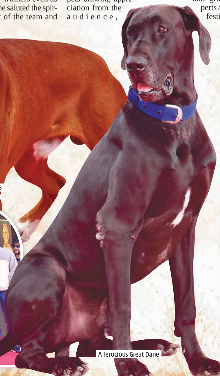
A ferocious Great Dane