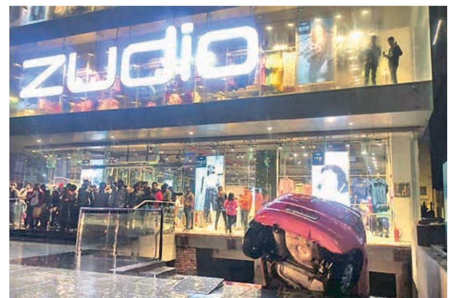
A driver lost control of his speeding car, causing the vehicle to crash into the basement of a Zudio showroom opposite Gaurav Tower in Jaipur on Sunday. No one was reported hurt in the incident.