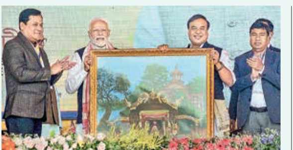
PM Modi being felicitated by Union Minister Sarbananda Sonowal and Assam CM Himanta Biswa Sarma on Sunday.

Guwahati: Prime Minister Narendra Modi on Sunday said that the Bharatiya Janata Party government at the Centre is moving towards making the electricity bill of the households in the country zero. The Prime Minister's remarks came while addressing a gathering after inaugurating and laying the foundation stone of projects worth Rs 11,000 crore here in Guwahati.