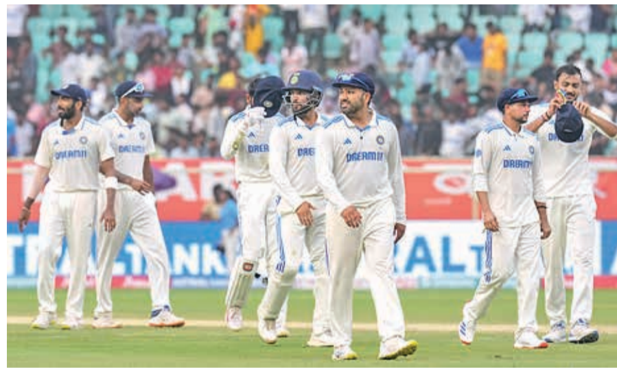
Indian players come out of the ground at the end of the third day of second Test match between India and England, at Dr YS Rajasekhara Reddy ACA-VDCA Cricket Stadium, in Visakhapatnam.