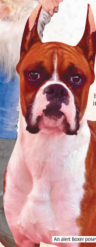
An alert Boxer poses