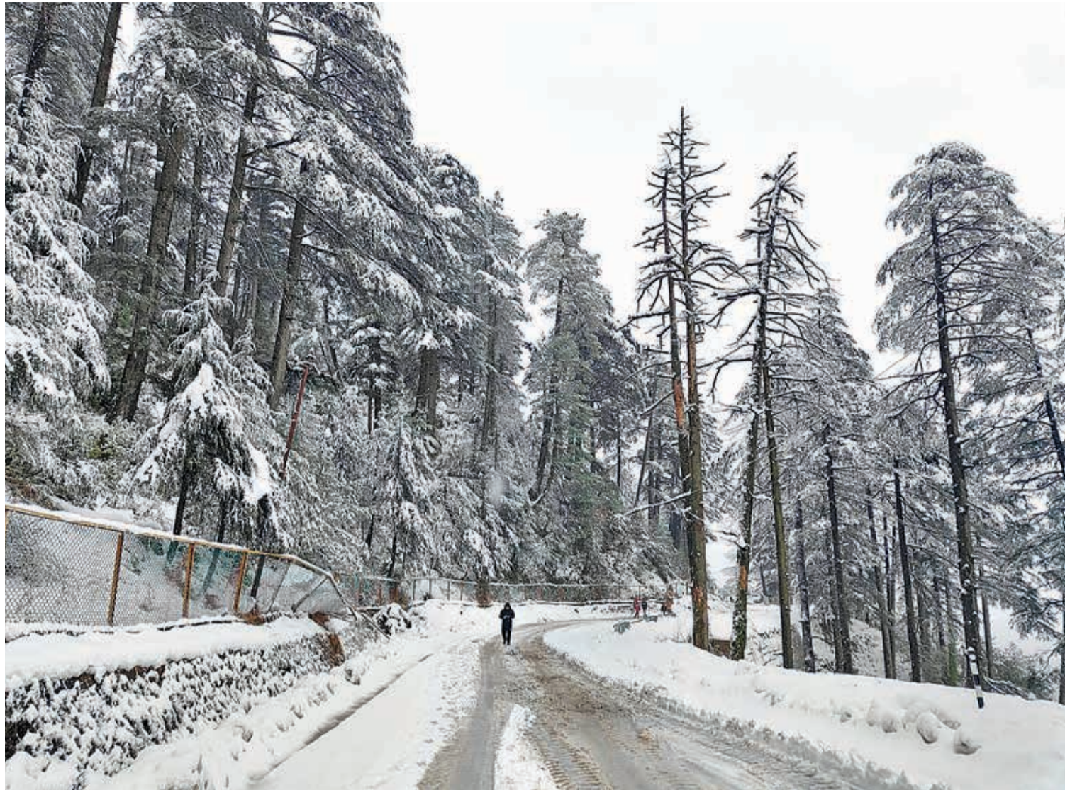
A glimpse of the snow-covered road following a fresh spell of snowfall at Kud, in Udhampur on Sunday.