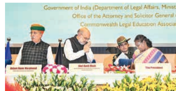
Prez Droupadi Murmu, Amit Shah and Arjun Ram Meghwal during the valedictory function of Commonwealth Attorneys & Solicitors General Conference 2024, in New Delhi, on Sunday.

Guwahati: Prime Minister Narendra Modi on Sunday inaugurated and laid the foundation stone for projects worth Rs 11,000 crores in Guwahati, Assam. The key focus areas in Guwahati include projects to boost sports & medical infrastructure and connectivity.