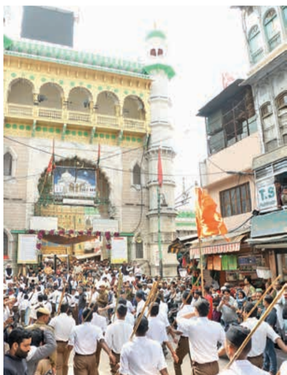
RSS volunteers taking out the 'path sanchalan' procession outside the Sufi Saint Khwaja Moinuddin Chishti's Dargah in Ajmer on Sunday.