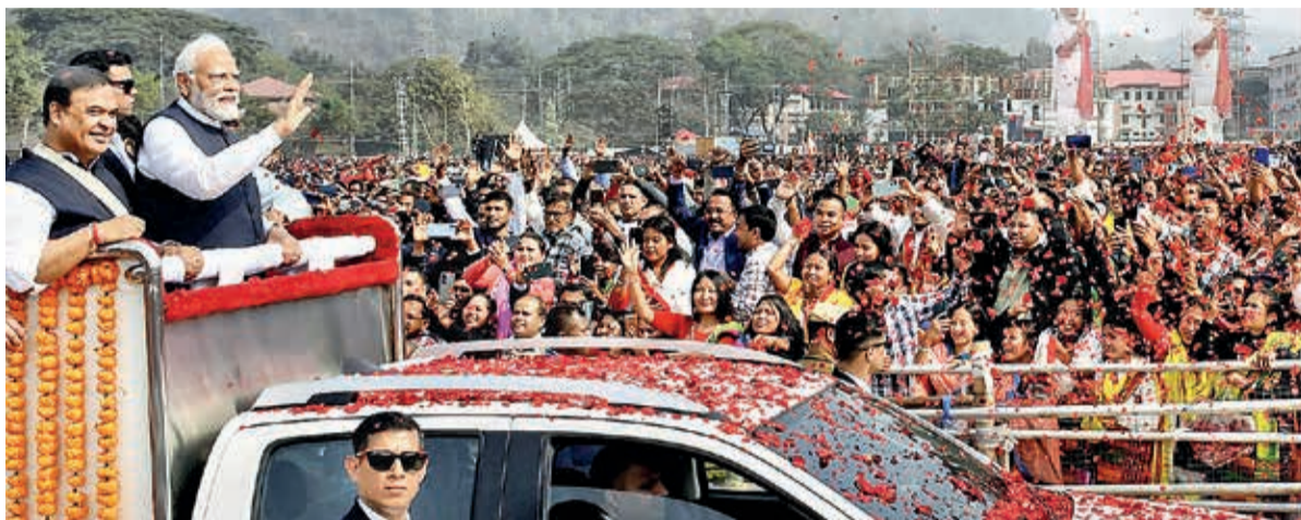
Prime Minister Narendra Modi with Assam Chief Minister Himanta Biswa Sarma arrives to attend the inauguration and foundation stone laying ceremony of various developmental projects, in Guwahati, on Sunday.

PM Narendra Modi on Sunday claimed that those who were in power after Independence could not understand the significance of places of worship and set a trend of being ashamed of their own culture for political reasons. At a massive rally here after unveiling infrastructure projects worth Rs 11,600 crore, Modi said no country can progress by erasing its past.