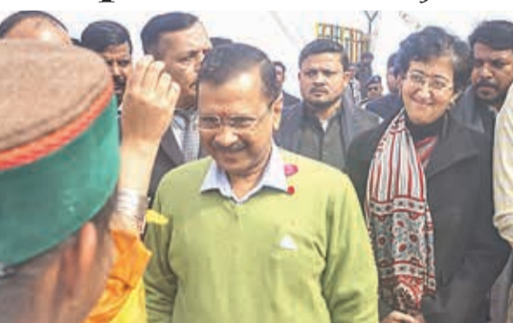
Arvind Kejriwal and Atishi Singh during the foundation stone laying ceremony of a govt school at Kirari, in New Delhi, Sunday.

Delhi Chief Minister Arvind Kejriwal on Sunday said the ongoing developmental works of his government for the people would not stop even if he was sent to jail. Laying the foundation stone of two school buildings at Kirari here, Kejriwal said, "Sisodia was put in jail because he built schools. Satyendar Jain was sent to jail because he built Mohalla clinics." Kejriwal alleged that central agencies such as