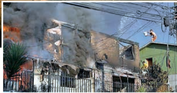
People try to extinguish a fire burning a house during the spread of wildfires in Vina del Mar, Chile on Sunday.

Forest fires raging in central Chile have killed at least 51 people and the death toll is likely to keep climbing, authorities said on Saturday, as emergency services battled to snuff out flames threatening urban areas.