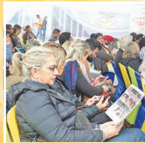
Foreign visitor delves into the First India Newspaper, Rajasthan's Own English Newspaper