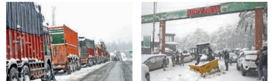
Vehicles queued up at the Srinagar-Jammu Highway amid fresh snowfall, in Srinagar on Sunday.