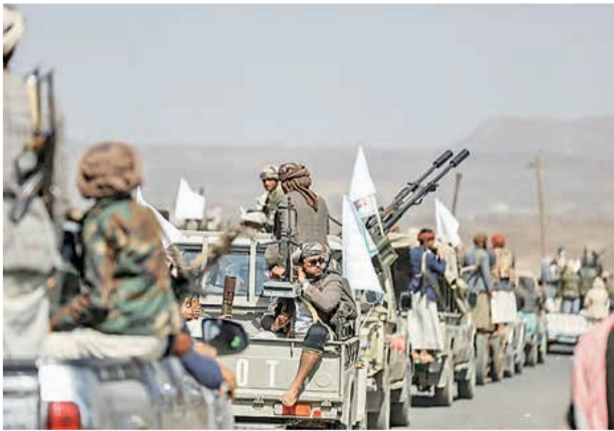
Houthi tribesmen gather to show defiance after US and UK air strikes on Houthi positions.

"We intend to take additional strikes, and additional action, to continue to send a clear message that the United States will respond when our forces