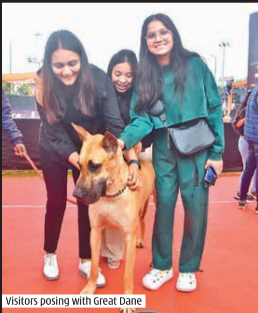
Visitors posing with Great Dane