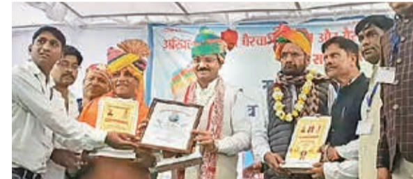
Dy CM Dr Prem Chand Bairwa being felicitated during the event in Shahpura on Sunday.

all to take 36 communities together and work wholeheartedly for the development of Shahpura. Expressing his gratitude to the BJP High Command, Bairwa said that by giving the responsibility of the post of deputy CM to the community, it has made the society of the entire state proud. "Now it is the responsibility of the society to work shoulder to shoulder by giving the message of unity in the times to come," he said.