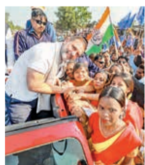
Congress leader Rahul Gandhi during the 'Bharat Jodo Nyay Yatra', in Bokaro, Sunday.

Congress leader Rahul Gandhi on Sunday said that his party stood for 'Jal-Jungle-Jamin' (water, forest and land) of tribal people and employment of youths. Gandhi was speaking during a roadshow in Jharkhand's Dhanbad district, as part of his 'Bharat Jodo Nyay Yatra'. After a night halt in Tundi block of the district on Saturday, the yatra resumed at Govindpur in Dhanbad city on Sunday, the third day of his yatra in Jharkhand.