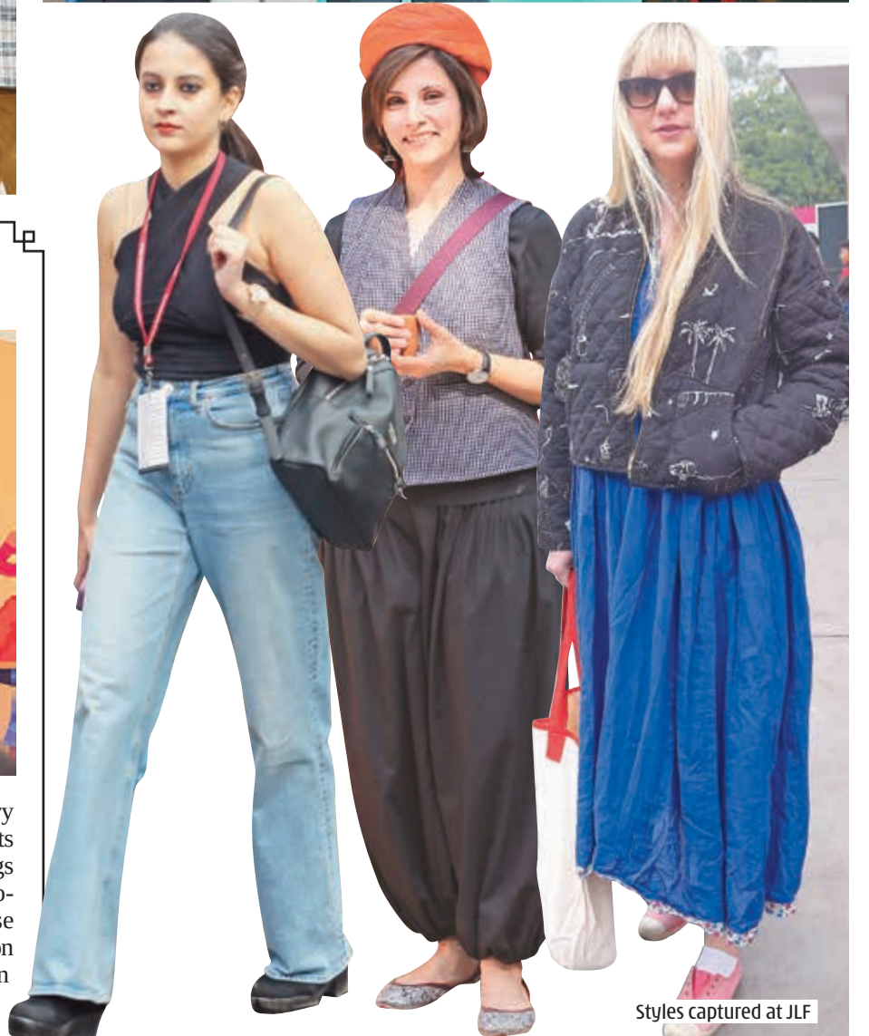
Styles captured at JLF

Nayar, Chowdhury shares her deep insights into the inner workings and often opaque processes behind these events and reflects upon what they indicate in the larger context.