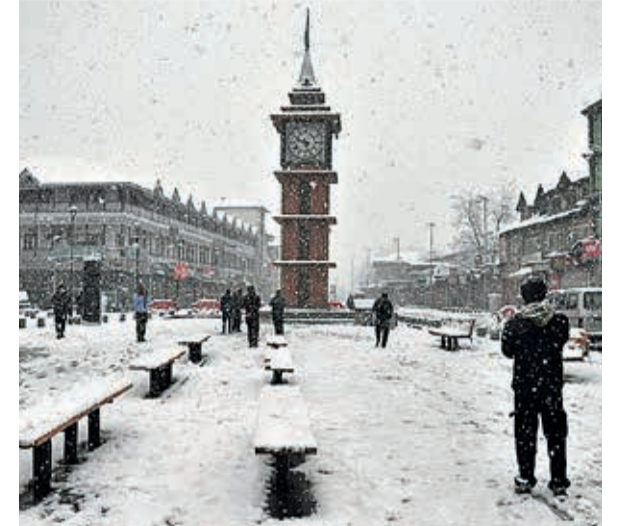
A view of the snow-covered Lal Chowk on Sunday.

Snowfall across the Kashmir Valley affected normal life on Sunday with all flights cancelled at Srinagar airport, officials said. The snowfall has forced the cancellation of all inbound and outbound flights from Srinagar airport for the day. Authorities have issued avalanche warnings for hilly and mountainous areas of Kashmir, urging the residents to avoid unnecessary movement.