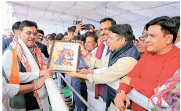
CM Bhajan Lal Sharma with locals at Banetha village on Sunday.