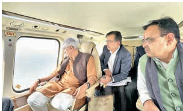
Union Minister Gajendra Singh Shekhawat and CM Bhajan Lal Sharma conduct aerial survey of Isarda & Navnera Dams.

Chief Minister Bhajan Lal Sharma, along with Union Jal Shakti Minister Gajendra Singh Shekhawat, inspected the pre-constructed and proposed main components of the Revised Parvati-Kalisindh-Chambal Link (Integrated ERCP) Project on Sunday. They visited the Bisalpur Dam, Mej Barrage, Kalisindh Dam, Chambal