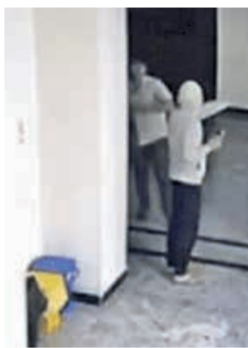
A CCTV video of the incident has also gone viral.