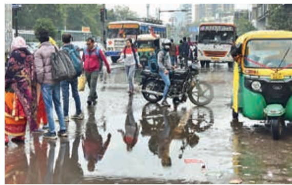
There was chaos on the roads as rain lashed the Pink City on Sunday. A drop in temperature was also witnessed.

The maximum rainfall was 21 mm in Goluwala of Hanumangarh, 10 mm in Dungargarh of Bikaner, 10 mm in Hanumangarh, 7 mm in Sangaria of Hanumangarh, 6 mm in Anupgarh