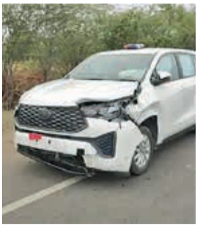
The car which was involved in the accident on Sunday.

Balotra SP's car hit a bike-ridden architect engineer, where and died on the spot after he fell 20-feet away.