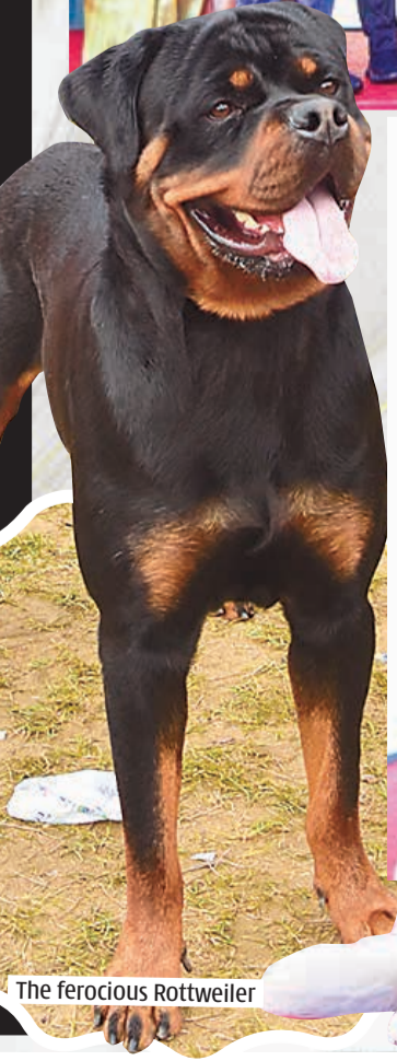
The ferocious Rottweiler