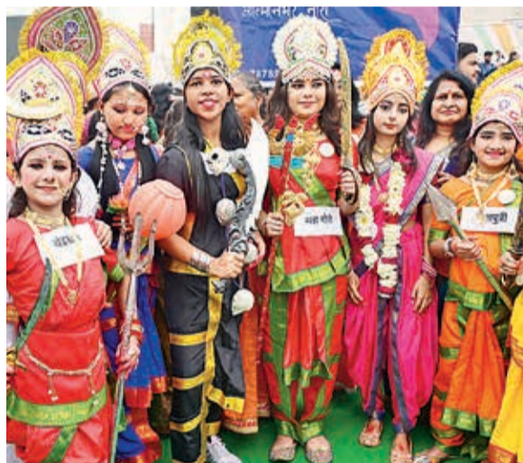
Girls and women dressed as goddesses, showing women power, during the walkathon event in Kota on Sunday.